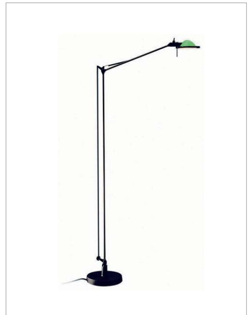
D12 EL t.